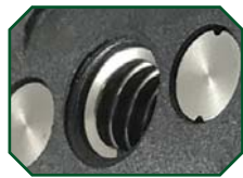
Heli-coiled Junctures Prevent Stripped Screws