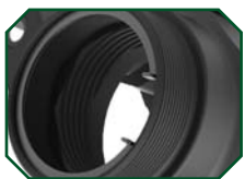
Objective Lens Clip Eliminates Disassembly