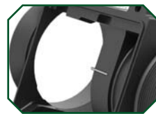
210° Tube Retention Without Epoxy

* Export of the items described herein is strictly prohibited without a valid export license issued by the U.S. Department of State, Directorate of Defense Trade Controls as proscribed in the International Traffic In Arms Regulations (ITAR), Title 22 Code of Federal Regulation, Parts 120-130.